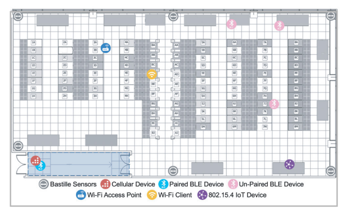
Bastille's Solution for Cloud Infrastructure Wireless Security

Bastille's Fusion Center automatically detects known wireless threats from its curated database of threats discovered by Bastille's Threat Research team and industry disclosed vulnerabilities. The Fusion Center platform offers highly customizable reports, provides rich API capabilities for integration with SIEM/SOAR systems, and is fully maintained and supported by Bastille along with the sensor arrays for the life of the subscription.